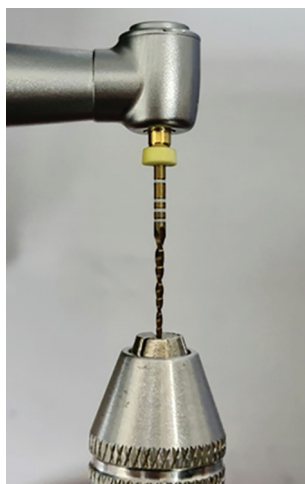
Fig. 1: Torsional static test device

The torsional test was performed using a torsional resistance testing device that was already validated in the literature. 18,19 A torque recording endodontic motor (KaVo, Biberac, Germany) appropriately modified to perform reciprocating motion, was used in this study. This endodontic motor could register the variations of the torque generated by the instrument during the intracanal instrumentation every 0.1 seconds. According to ISO 3630-1, the tip of the file was blocked at 3 mm from the tip, stuck in a vise (Fig. 1).