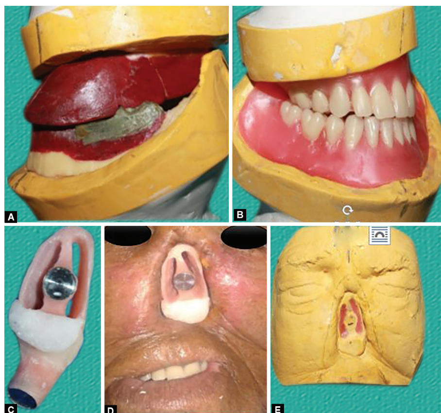
Figs 2A to E: (A) Recording maxillomandibular relation; (B) Prosthetic teeth assembly; (C) Fixing magnets on intermediate piece; (D) Checking adaptation of dental prosthesis and intermediate piece after magnetic connection; (E) Facial mold

The maxillomandibular relation has been recorded using classical techniques for complete removable prosthesis utilizing the Ballard class III promandibulie scheme. Taking into account the quality of the fragile maxillary support surface and to reinforce the prosthetic balance, the classic triad of Housset 3 was applied to provide the tightness for the therapeutic success. The position of the occlusion plane was very important for this equilibrium, which brings it closer to the possible limit of the maxillary support surface and also influences the esthetics of the patient. Centric relation with an undervalued vertical dimension was maintained to avoid any trauma to the bearing surface with more possibility for maxillofacial physiotherapy by minimizing prosthetic space. The teeth arrangement was done in a cross-functional assembly (Figs 2A and B) to provide better orientation of occlusal forces in levitation polygons to provide prosthetic balance in static and