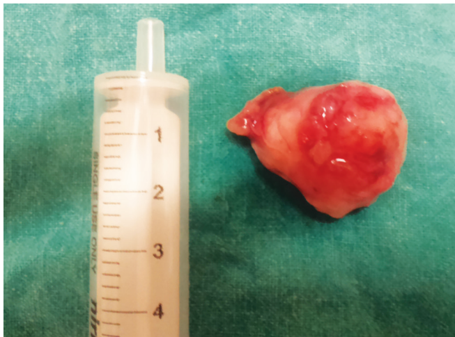
Fig. 2: Surgical pathology specimen after removal