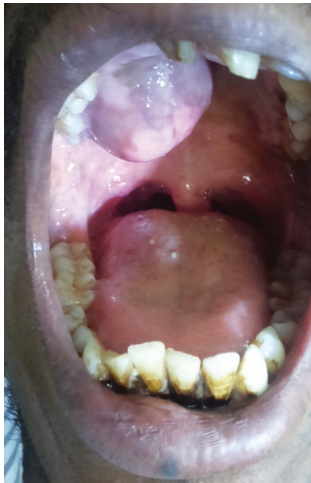
Fig. 1: Oral cavity examination showing swelling over right side of the hard palate