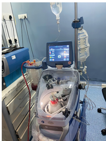
Fig. 1: Cell salvage machine